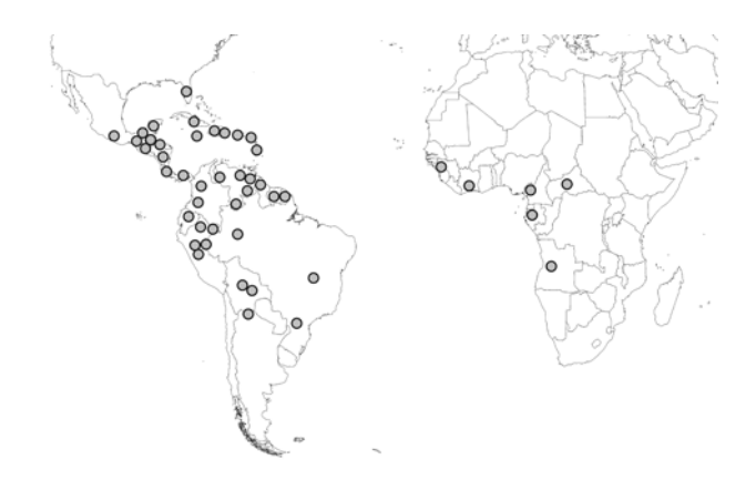
Fig. 1 Locations of E. alta used in the ecological niche modeling.

In total 54 localities were included in the database (Fig. 1, Tab. 1), 8 African and 46 Neotropical, which is more than the minimum number of localities (>5) required by Maxent to obtain reliable predictions [23].