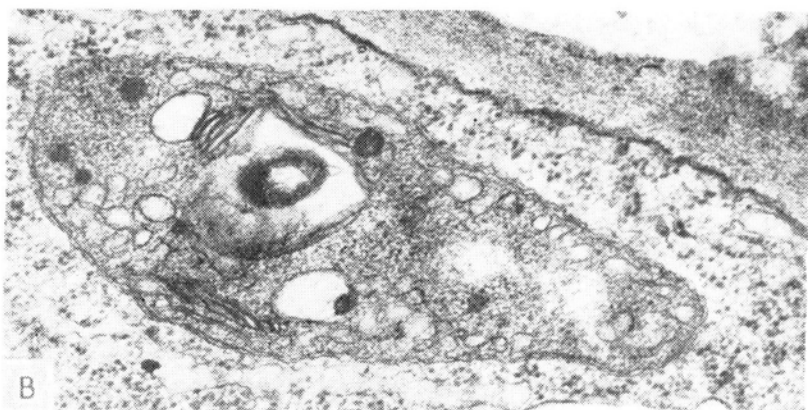
Fig. 3. A, B — Ultrastructure of chloroplasts from yellow spots of the variegated leaves of A. platyoides at the spring time. Numerous vesicles and rarely also single granum may occur in the stroma. A — 35000 \times , B — 39200 \times .