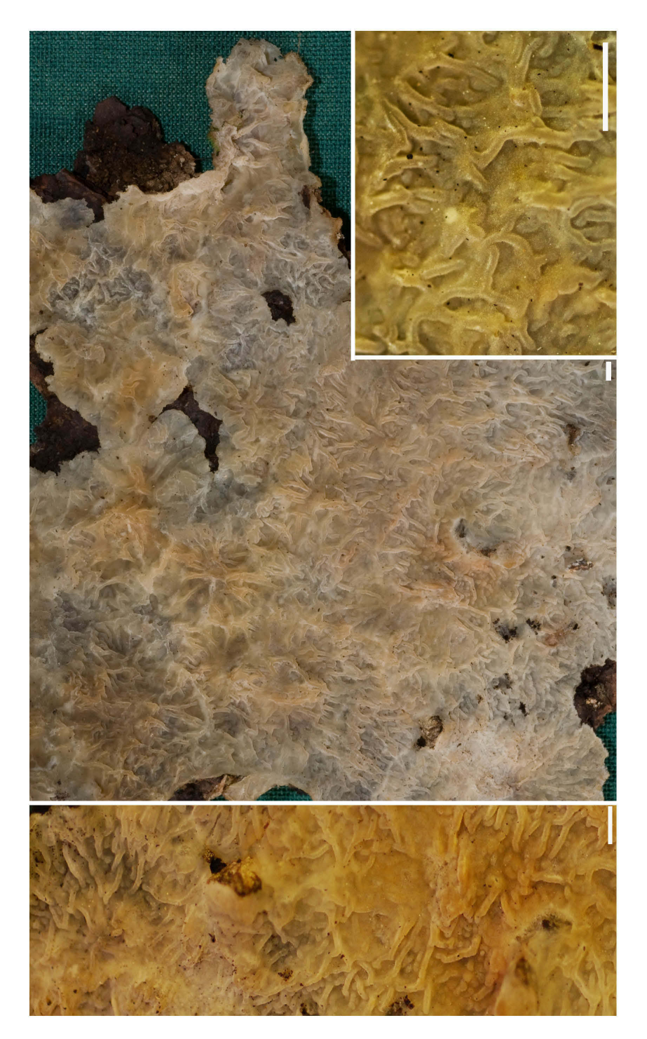
Fig. 1. Aspects of basidiocarp of Phlebia tremelloidea (fresh material; LE 269621) highlighting hymenophoral merulioid folds. Scale bar = 1 mm.