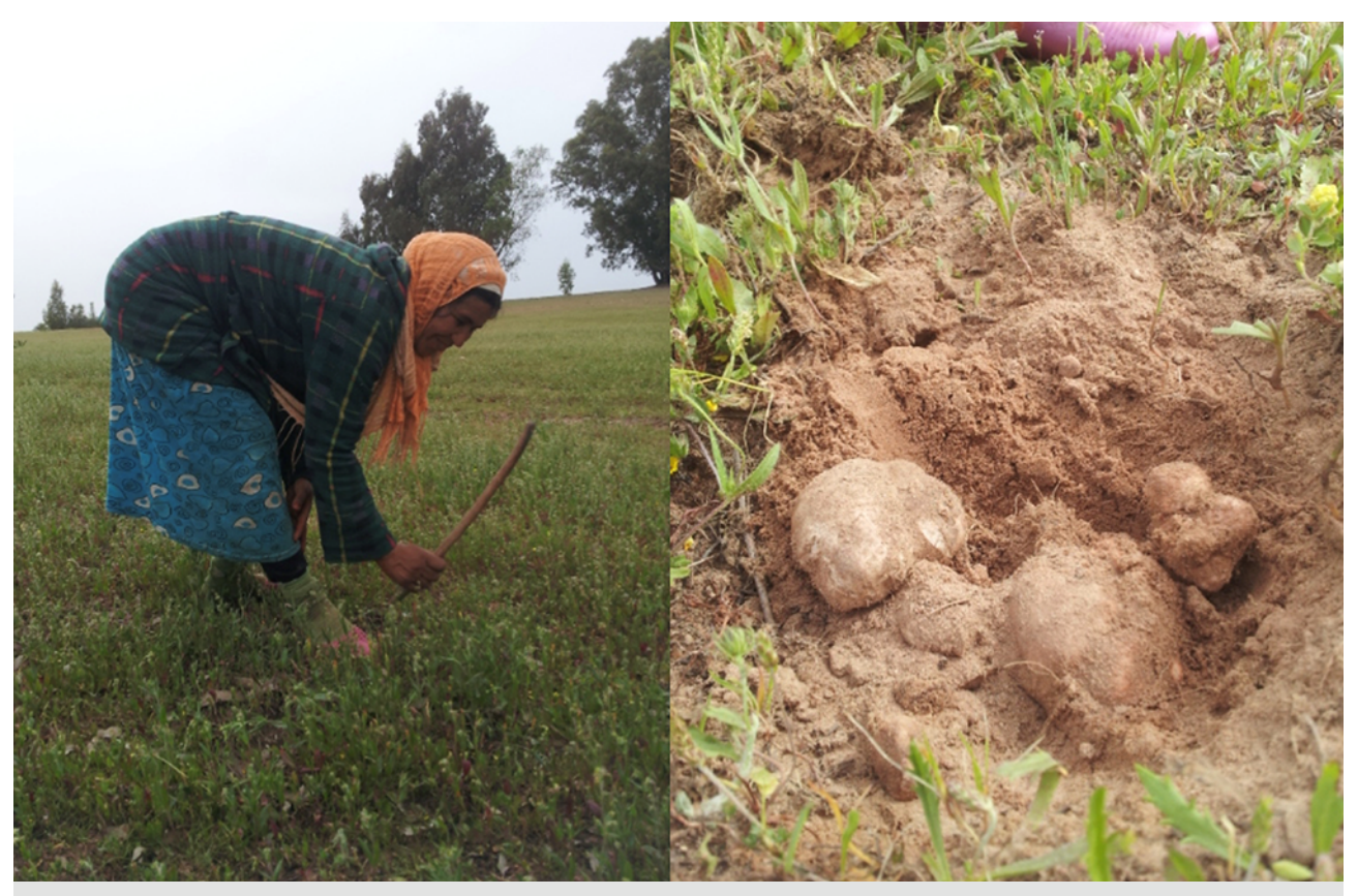
Fig. 2 Desert truffles ( Terfezia arenaria ) being located in Morocco using the "stick" method (left) and freshly unearthed fruiting bodies (right).