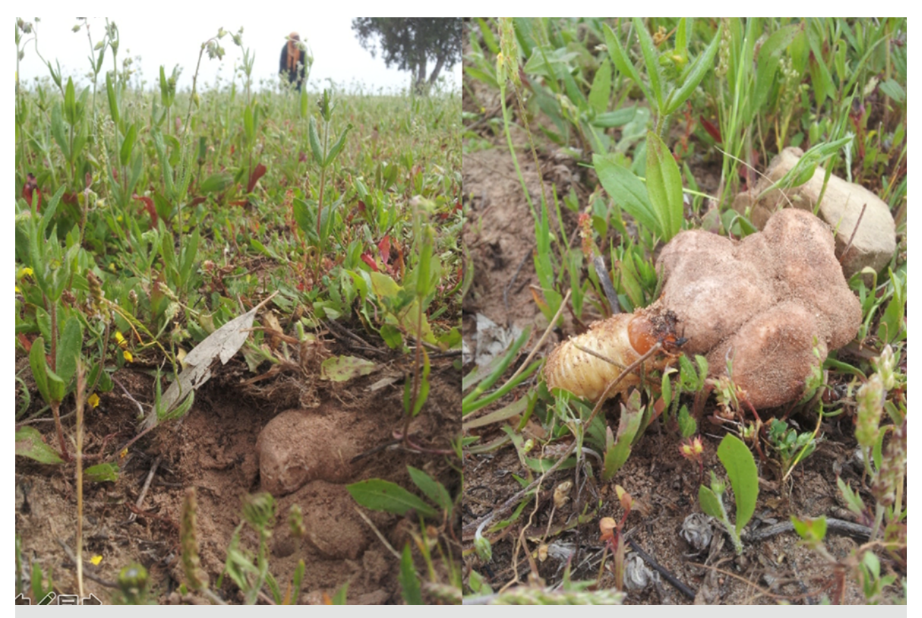
Fig. 3 Desert truffle ( Terfezia arenaria ) in the soil (left) in Morocco and an example of larvae (unidentified) that are occasionally found in close proximity to the fruiting body (right). Note: these larvae do not seem to damage the truffle, but may benefit from the locally elevated moisture levels. The photographs were taken by the corresponding author.