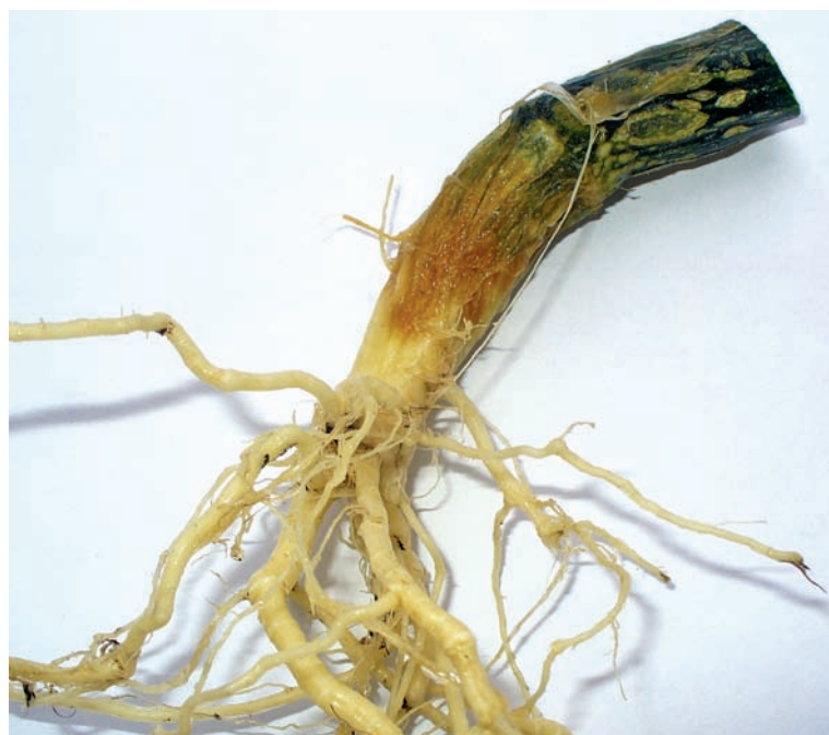
Fig. 1 Root rot of zucchini stem base