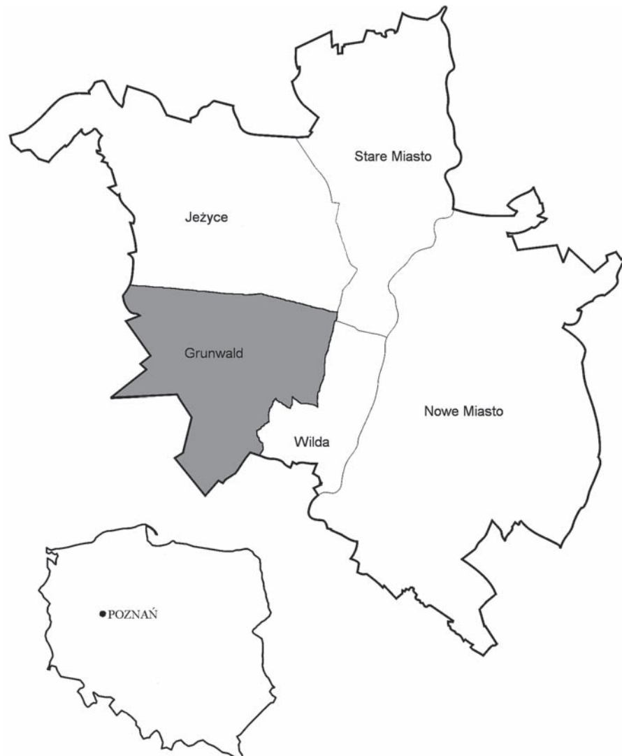
Fig. 1. District division of Poznań territory

Grunwald occupies the south-western part of Poznań (Fig. 1). The name of the district was adopted after WWII after the name of one of the main traffic arteries in that area, i.e. Grunwaldzka Street (Łęcki and Maluśkiewicz, 1998). Grunwald is the third district of the city in terms of its size. In 2005 its area was 3619 ha and constituted 13.8% of the area of Poznań (The Statistical Yearbook of Poznań, 2007). The boundaries of the district are marked by the following streets: Bukowska, Roosevelta, Przełęcz, Głazowa, Piargowa, Leszczyńska, Pszczyńska, and the railway tracks of the Zbąszynek line and a stream, Strumień Junikowski.