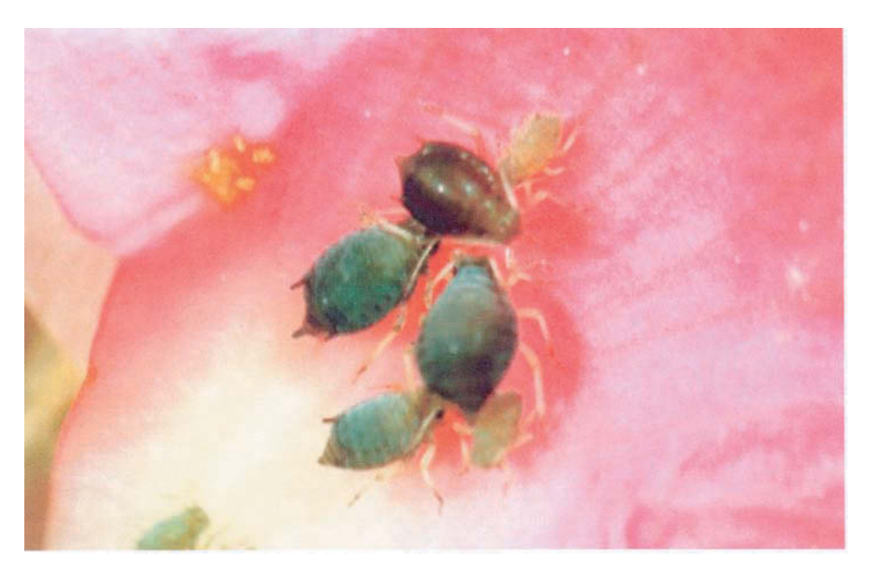
Fig. 2. Aphis fabae Scop. feeding on the crown petals of roses.