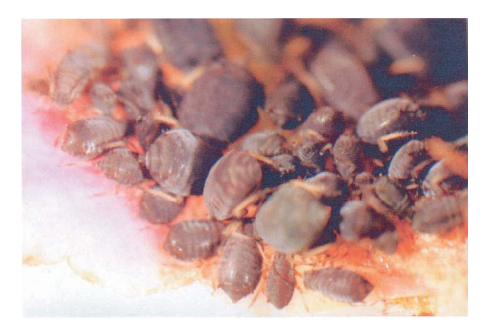
Fig. 3. Aphis fabae Scop. feeding on the crown petals of roses.